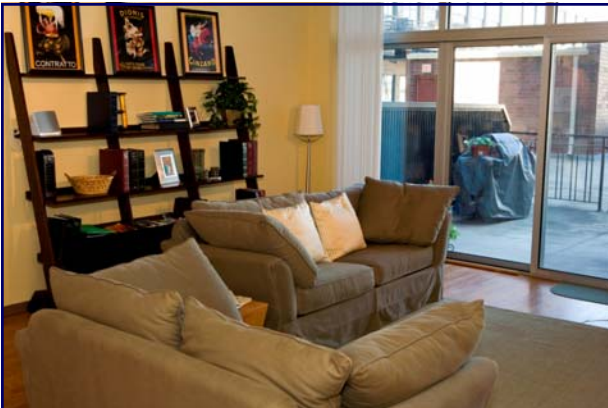
Living Room view of sliding doors to huge private patio