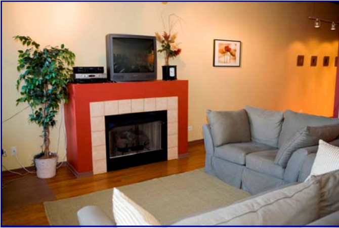
Living room with fireplace and hardwood floors