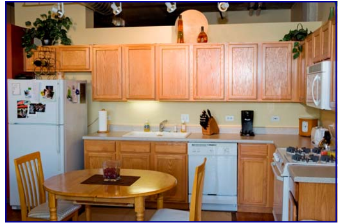
Fully appointed kitchen with hardwood floors