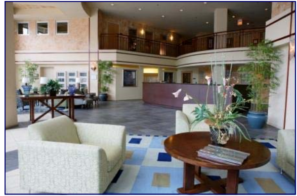
Elegant, spacious professionally decorated lobby