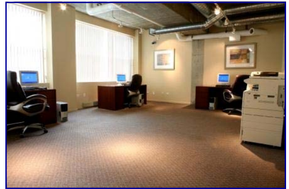
Full service Wi-Fi Business Center

Fabulous roof top sun deck with spectacular views